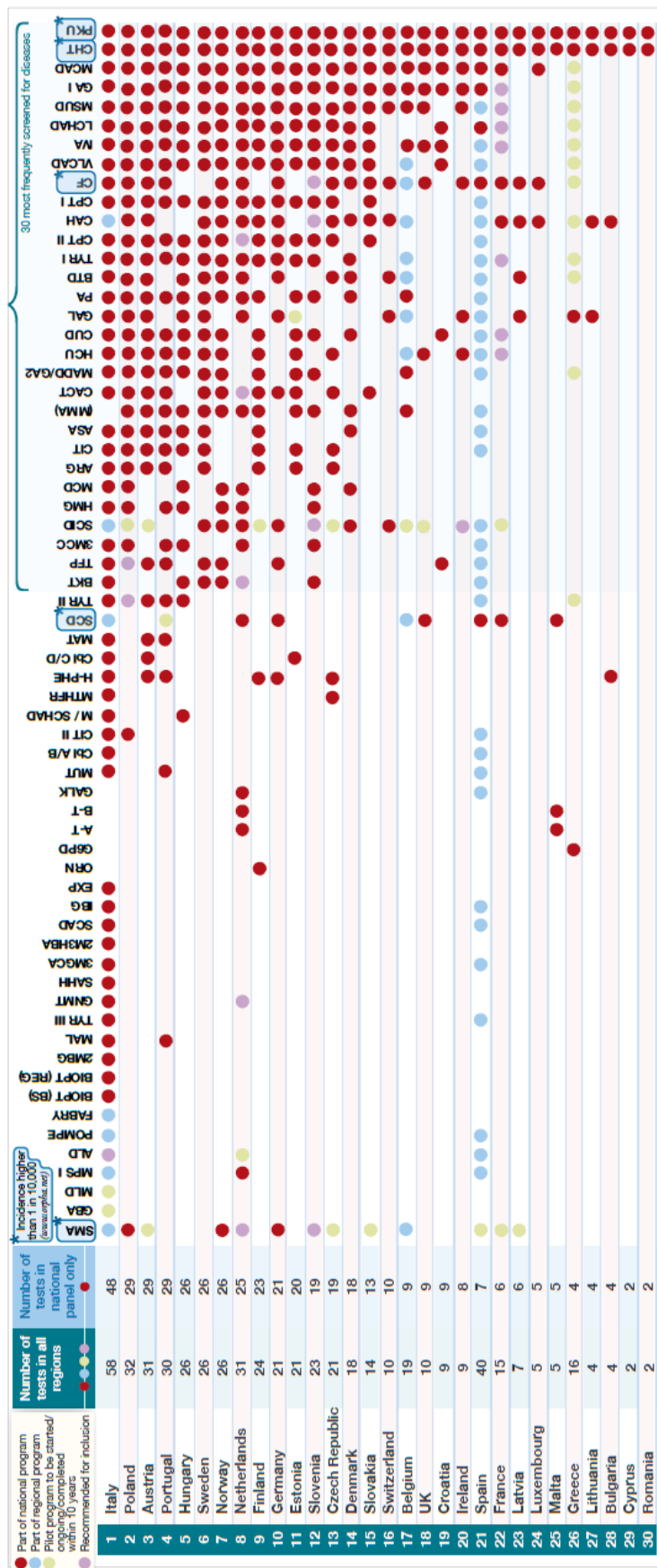
Figure 1: Mapping of disease inclusion in NBS panels across 30 European countries

see end of document for disease abbreviations.